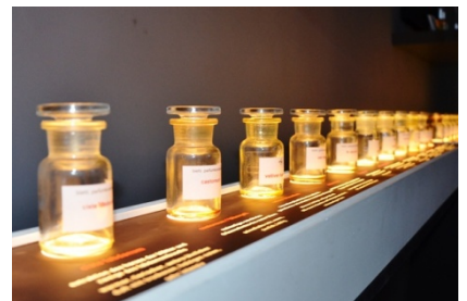
perfume inspired 4 course menu