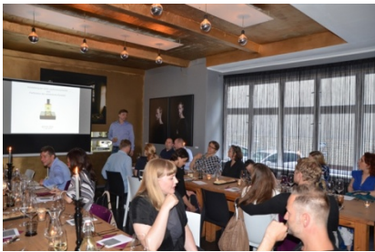
presentation biehl. parfumkunstwerke

the new perfume was personally presented by its creator, berlin based perfumer geza schön , one of the most innovative, rebellious and respected perfumers of our times. the culinary highlight, a 4 course perfume-inspired-menu, crowned this unforgettable evening.