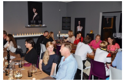
raw material exhibition